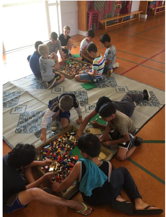
Lego club: The seniors and the juniors have been enjoying the Lego Club being held in the hall every Tuesday .